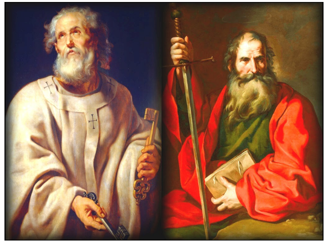
The Solemnity of Saints Peter and Paul ~ June 29th

Participation in one of our preparation classes, either in Spanish or in English, is necessary to schedule a day and time for a Baptism in either HN or SPN churches. Formal registration and participation in the parish is a prerequisite, and pre-registration is further required to attend the class. Please contact the secretary of your respective parish, Holy Name or St. Philip Neri-Blessed Sacrament, to pre-register.