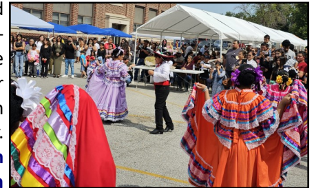
Folkloric dancers at the Holy Name Parish Festival 2025