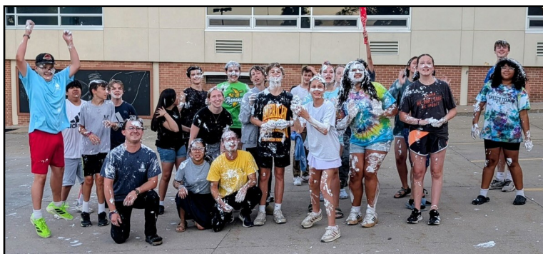
Totus Tuus Missionaries and Teen Helpers