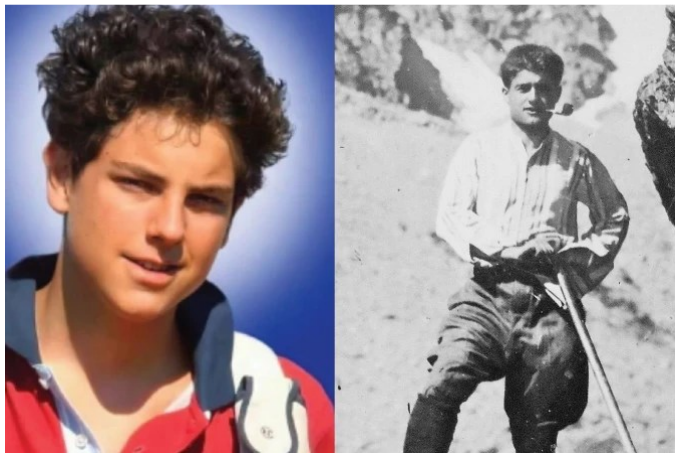
St. Carlo Acutis & St. Pier Giorgio Frassati

Earlier this morning, September 7 th , both Bl. Carlo Acutis and Bl. Pier Giorgio Frassati were canonized Saints by Pope Leo XIV during Mass in Rome.