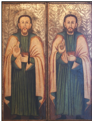
Ss. Cosmas and Damian

The first class relics of Ss. Cosmas & Damian are available for veneration in SPN Church after the 8:15 a.m. Mass this Friday, September 26 th , their feast day. Ss. Cosmas & Damian were early Christian martyrs who were not only physicians but miraculous healers. Consider asking their heavenly intercession for all types of healing, for yourselves and/or for loved ones. You may touch the relic or simply say a prayer before them.