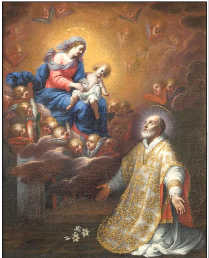
St. Philip Neri, the Blessed Mother & the Christ Child

https://catholicexchange.com/12-sayings-from-st-philip-neri/