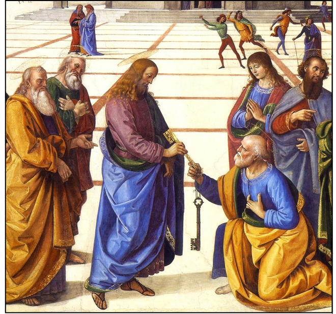
Christ Handing the Keys to St. Peter, by Pietro Perugino

When Jesus went into the region of Caesarea Philippi he asked his disciples, "Who do people say that the Son of Man is?" They replied, "Some say John the Baptist, others Elijah, still others Jeremiah or one of the prophets." He said to them, "But who do you say that I am?" Simon Peter said in reply, "You are the Christ, the Son of the living God." Jesus said to him in reply, "Blessed are you, Simon son of Jonah. For flesh and blood has not revealed this to you, but my heavenly Father. And so I say to you, you are Peter, and upon this rock I will build my Church, and the gates of the netherworld shall not prevail against it. I will give you the keys to the Kingdom of heaven. Whatever you bind on earth shall be bound in heaven; and whatever you loose on earth shall be loosed in heaven."