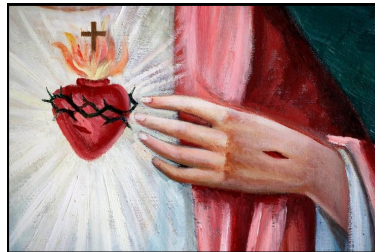
Detail of a painting of the Sacred Heart of Jesus in the Visitation Monastery in Marclaz, France