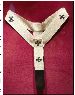
Example of a pallium