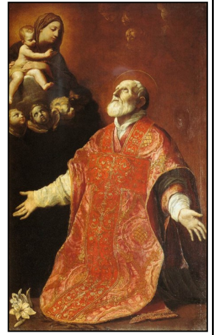
St. Philip Neri in Ecstasy, by Guido Rene