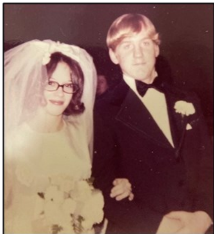
At their wedding