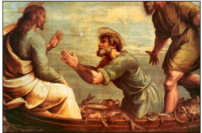
The Miraculous Draught of Fishes, by Raphael

How can I make my life a gift for others in charity? Perform a nightly Examen so that you become more attentive to God's action throughout your day. (catholic.bible/lectio-divina-in-english)