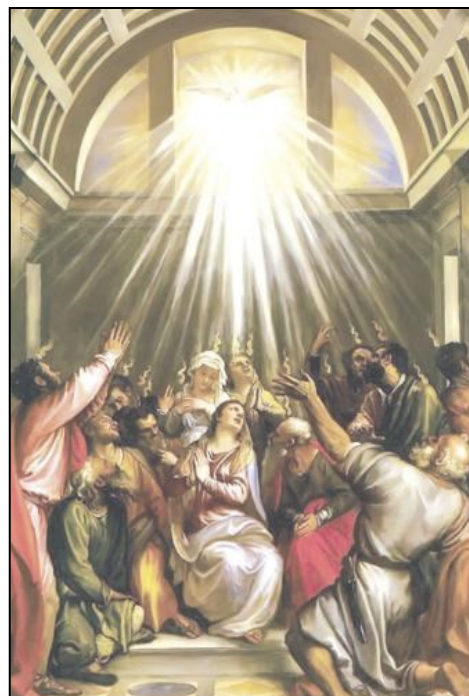
The Descent of the Holy Ghost, by Titian

Prayer for the Conclave The Cardinals will gather in the Sistine Chapel at the Vatican beginning May 7th to discern and elect the next Pope. We ask the Holy Spirit to illuminate them in their discernment, and to guide them to elect the Vicar of Christ that Our Lord has chosen for us.