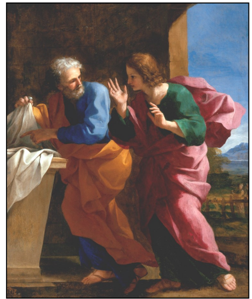
St. John and St. Peter at Christ's Tomb, by Giovanni Francesco Romanelli

At daybreak on the first day of the week the women who had come from Galilee with Jesus took the spices they had prepared and went to the tomb. They found the stone rolled away from the tomb; but when they entered, they did not find the body of the Lord Jesus. While they were puzzling over this, behold, two men in dazzling garments appeared to them. They were terrified and bowed their faces to the ground. They said to them, "Why do you seek the living one among the dead? He is not here, but he has been raised. Remember what he said to you while he was still in Galilee, that the Son of Man must be handed over to sinners and be crucified, and rise on the third day." And they remembered his words. Then they returned from the tomb and announced all these things to the eleven and to all the others. The women were Mary Magdalene, Joanna, and Mary the mother of James; the others who accompanied them also told this to the apostles, but their story seemed like nonsense and they did not believe them. But Peter got up and ran to the tomb, bent down, and saw the burial cloths alone; then he went home amazed at what had happened.