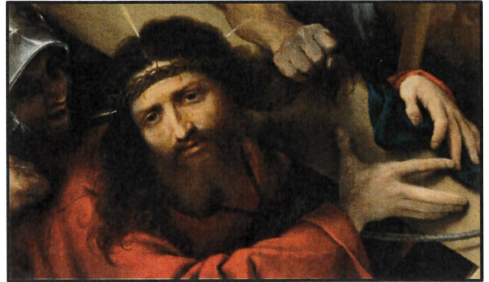
The Road to Calvary by Lorenzo Lotto