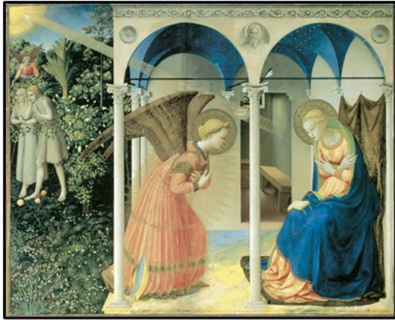
The Annunciation by Blessed Fra Angelico

Ever wonder why the months of September, October, November, and December derive from the numbers 7, 8, 9, and 10? It's because our calendar year, from the Middle Ages until the 17 th and even 18 th centuries, began in March. In fact, until 1752 the United States colonies celebrated New Year's Day on March 25 th ! If March is considered the first month, then September is the seventh month, October is the eighth month, and so on and so on. I only learned this astonishing fact while reading about our current Jubilee Year of 2025. Why was March long considered the first month of the year?