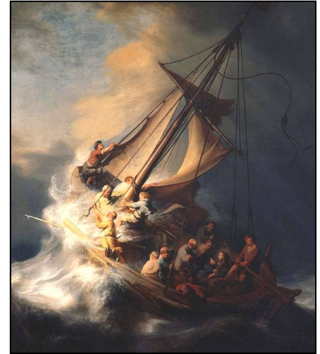
Christ Calms the Sea, by Rembrandt

The schedule for the day includes Mass, talks, time for Confession, quiet time for Adoration of the Blessed Sacrament, great food, and wonderful conversation. Please bring your Bible.