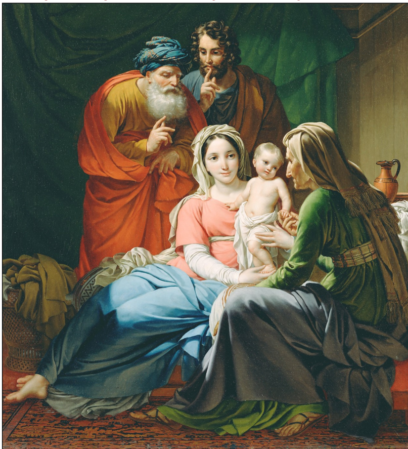
The Holy Family , by Joseph Paelinck