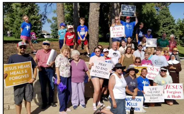
St. Philip Neri-Blessed Sacrament & Holy Name parishioners gather at Life Chain 2023