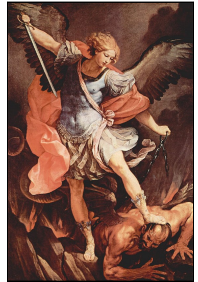
Michael, by Guido Reni