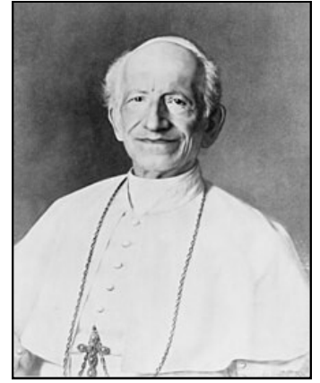
Pope Leo XIII

This Friday is First Friday, and we will host all day exposition of the Blessed Sacrament in our SPN Church from 9 a.m.-9 p.m. Please come and spend some time with Jesus; all adorers who have committed to an hour of adoration on First Fridays are reminded to attend their hour.