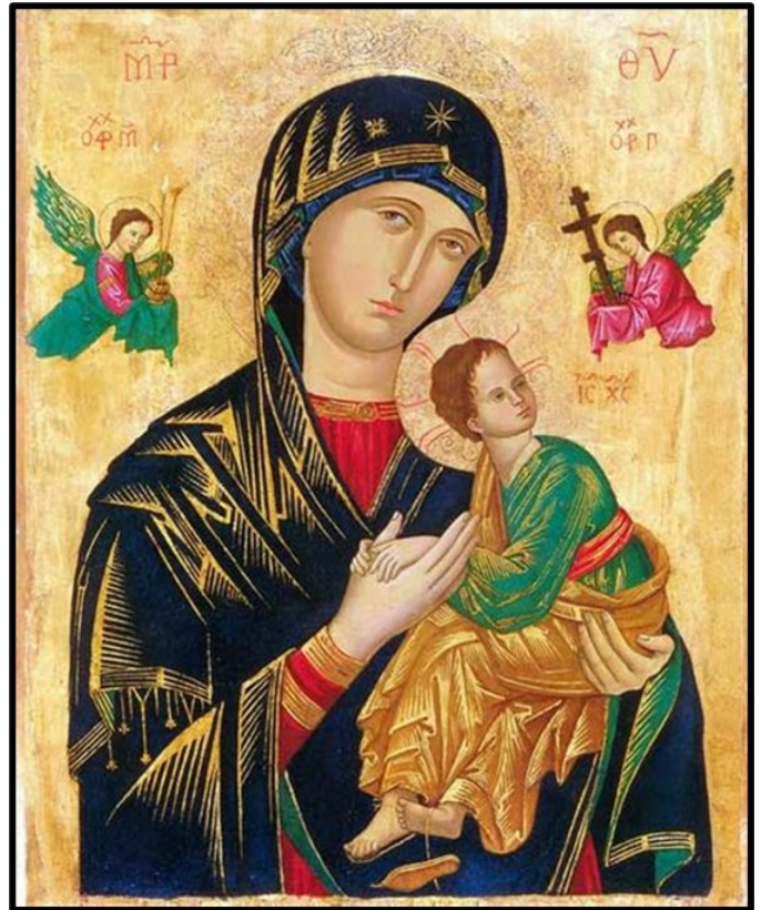
Icon of Mary, Mother of Perpetual Help

The memorial of Mary, the Mother of Perpetual Help is held on June 27 th every year. Unlike conventional western art that has historically sought to portray an idea, event, landscape, or person, icons are more mysterious. Icons are not painted but written. The Logos, the Word of God, speaks through them. Icons are not a picture of heaven but a window onto it. When one prays before an icon, one doesn't just remember its subject matter; one encounters the subject him- or herself, one experiences the divine reality. By grace, the icon makes the reality present and so approximates a sacrament. For this reason, candles burn before icons like the sanctuary lamp does before the tabernacle. There are icons of the Mother of Perpetual Help in both of our Holy Name and St. Philip Neri churches and schools.