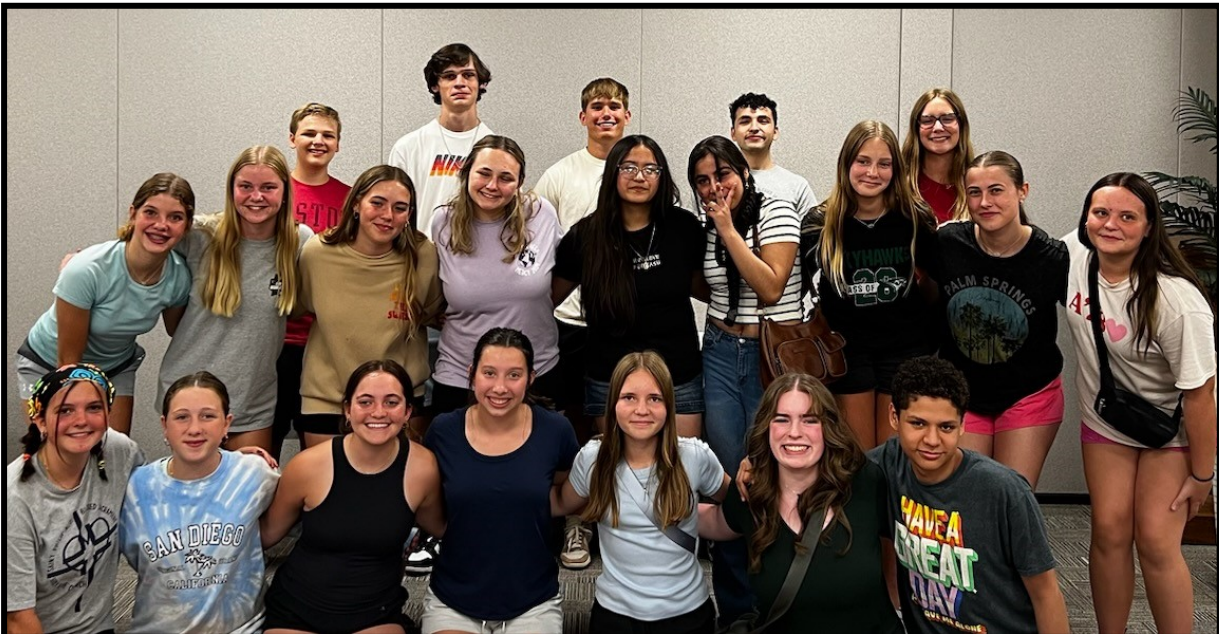
HN and SPN-BS youth who traveled to the Steubenville Conference July 5-7 reconvene on July 17 at St. Philip Neri to share their experiences and grow in faith.