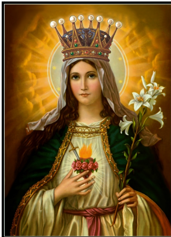
Mary, Queen of Heaven and Earth

By His generous grace, we, too, will one day reign with the Savior, princes and princesses, kings and queens, in His Celestial Kingdom.