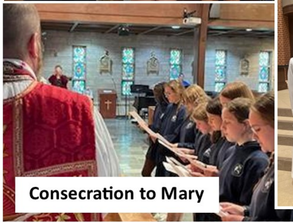
Consecration to Mary