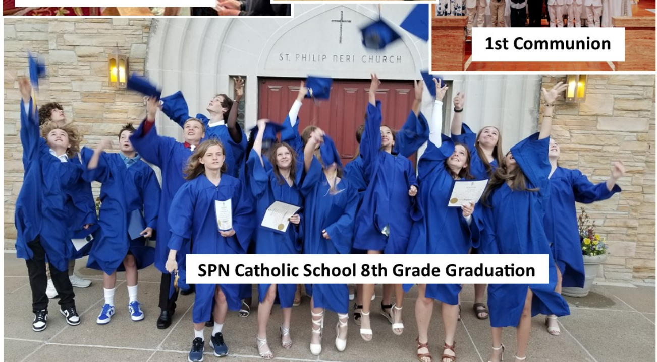
SPN Catholic School 8th Grade Graduation