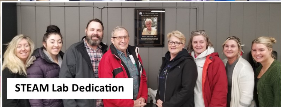
STEAM Lab Dedication