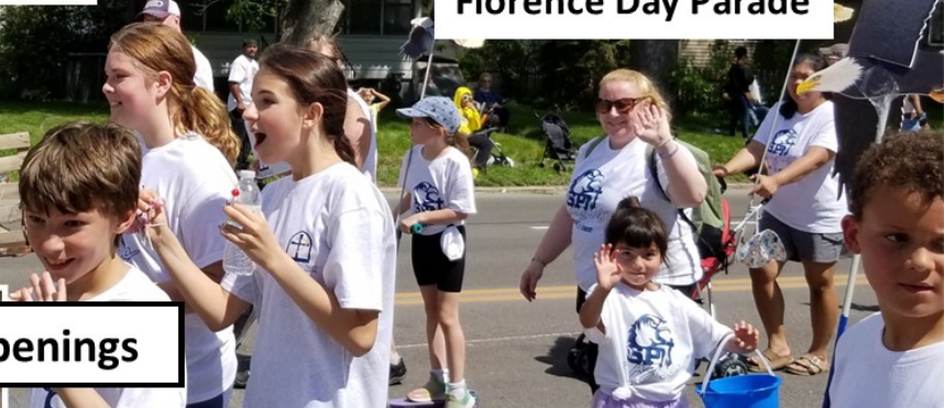
Florence Day Parade