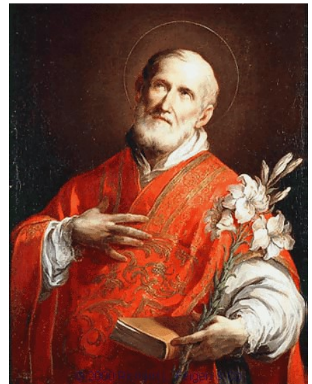
Saint Philip Neri, pray for us