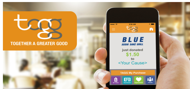
Please keep in mind that all special preorders are due by 10:00 a.m. on Tuesdays.

To continue this program, our Parish must have a minimum of 20 TAGG's per month!